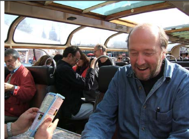
A tour on the canal