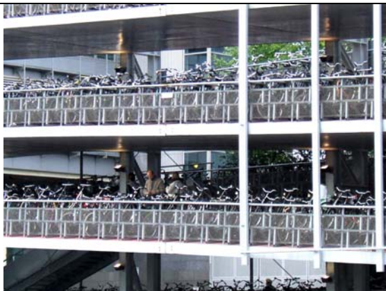
one of the fascinating things about Amsterdam are all the bikes